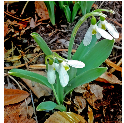
SPRING IN BLOOM Lily on 23 rd Street

AHCA is committed to inclusivity and open, civil dialogue.