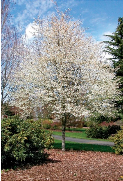
Allegheny Service Berry