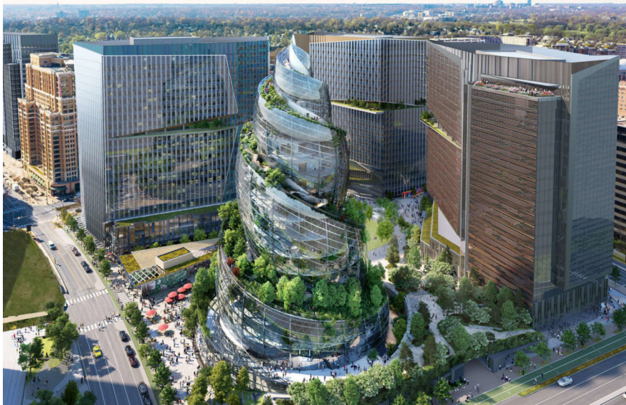
The Helix, (Photo courtesy Amazon)

AHCA is doing its best to keep up with the unprecedented amount of activity happening in our neighborhood. Read on for details, and please remember to support our work with your yearly $20 dues that can be paid online at aurorahighlands.org if you haven't already.